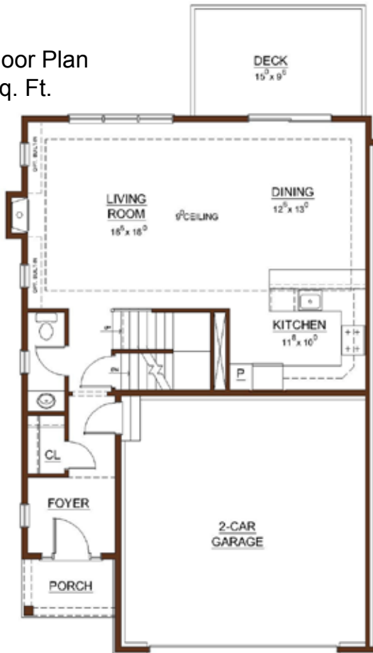
First floor Plan 835 Sq. Ft.